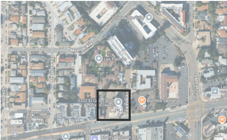
5322 El Cajon Blvd, San Diego, CA 92115

In addition, the project addresses parking challenges by exploring options to increase available stalls to better serve students, staff, and the surrounding community.